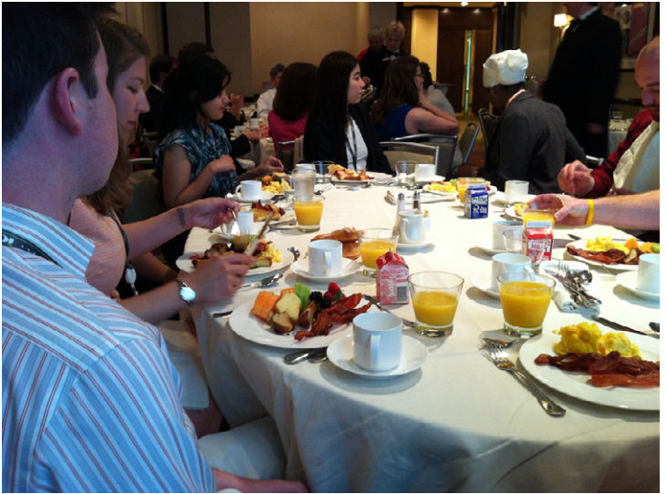
❑ Students enjoyed breakfast with the alumni at AAPG